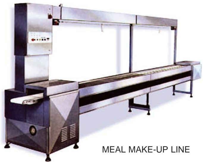
MEAL MAKE-UP LINE