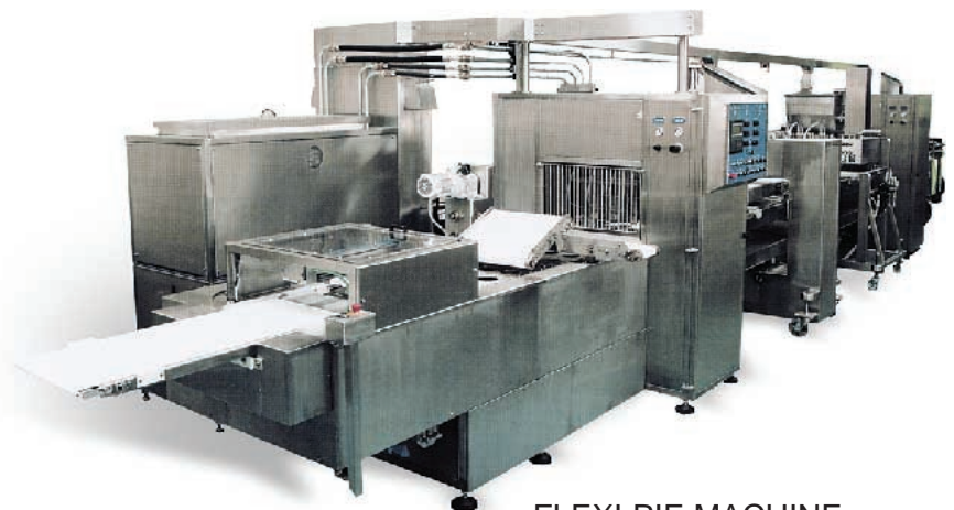
FLEXI PIE MACHINE